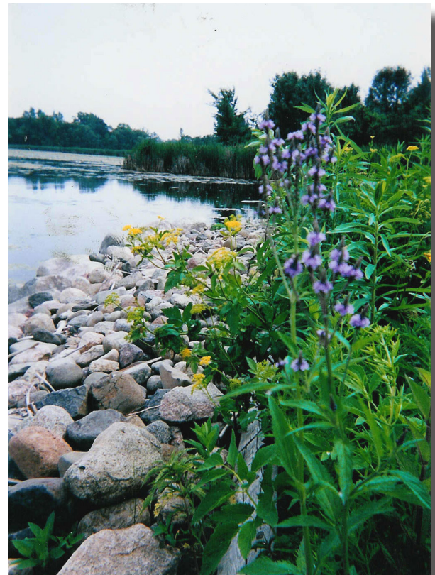
Shoreline stabilized with riprap and enhanced with a vegetative buffer.

Natural rock riprap consists of coarse stones randomly and loosely placed along the shoreline. You should consult your DNR Area Hydrologist to determine whether your shoreline needs riprap to stop erosion. If there is a demonstrated need, such as on steep slopes, you may want to consider placing riprap or a combination of riprap and vegetation. In most cases, vegetation planted in the rocks will stabilize the riprap and improve the appearance of your shoreline. Naturalizing your shoreline is the most important contribution you can make to enhance water quality, maintain fishery resources, and provide wildlife habitat.